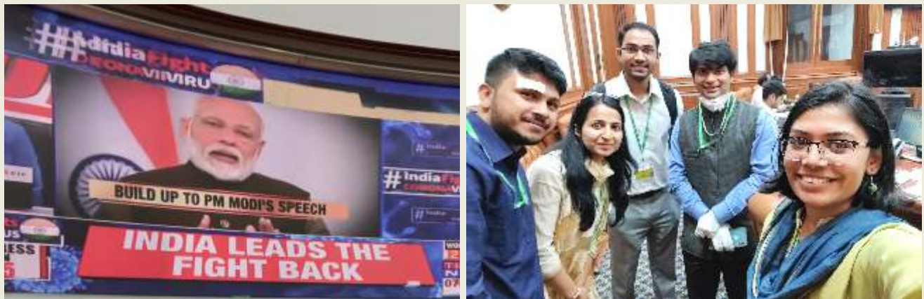
(Deployment of IFS OTs at COVID-19 Control Room, MEA, New Delhi)

Phase-II of ITP commenced on 15 June 2020 through webinar and is in progress.