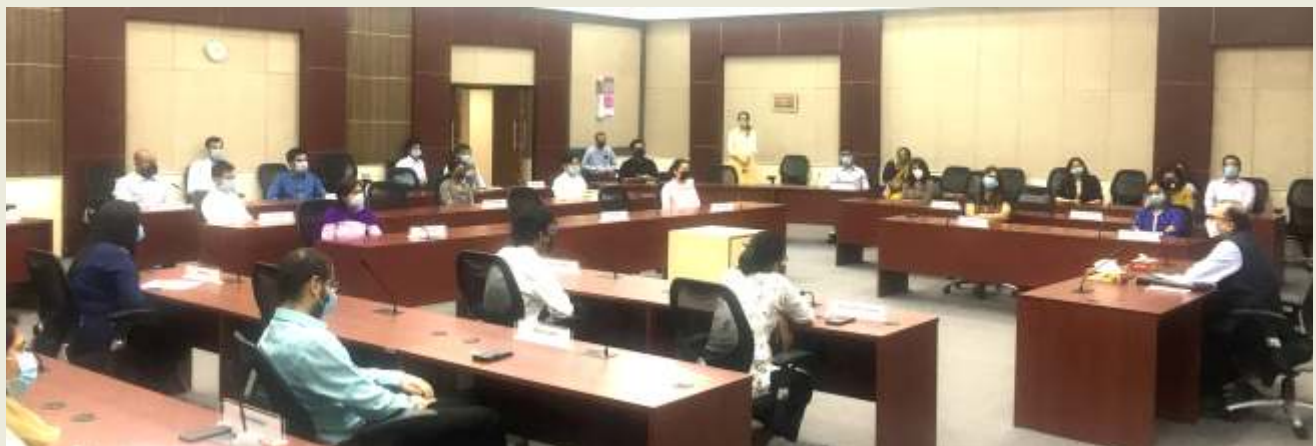
(Address by Dean (SSIFS) to IFS OTs in the Phase-II of ITP)