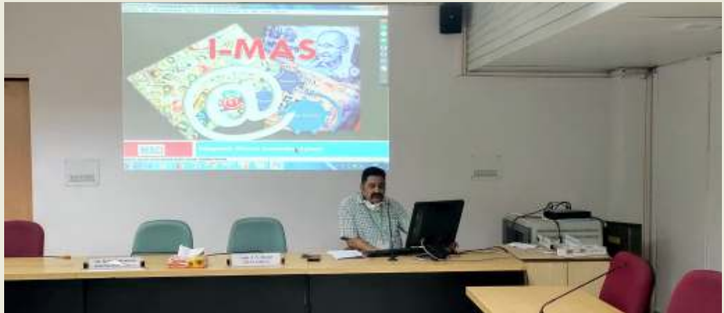
(Speaker addressing on webinar to participants of IMAS Training Programme)

A 1-day IVFRT (consular) training was conducted on 13 June through webinar. The training was attended by 51 participants.